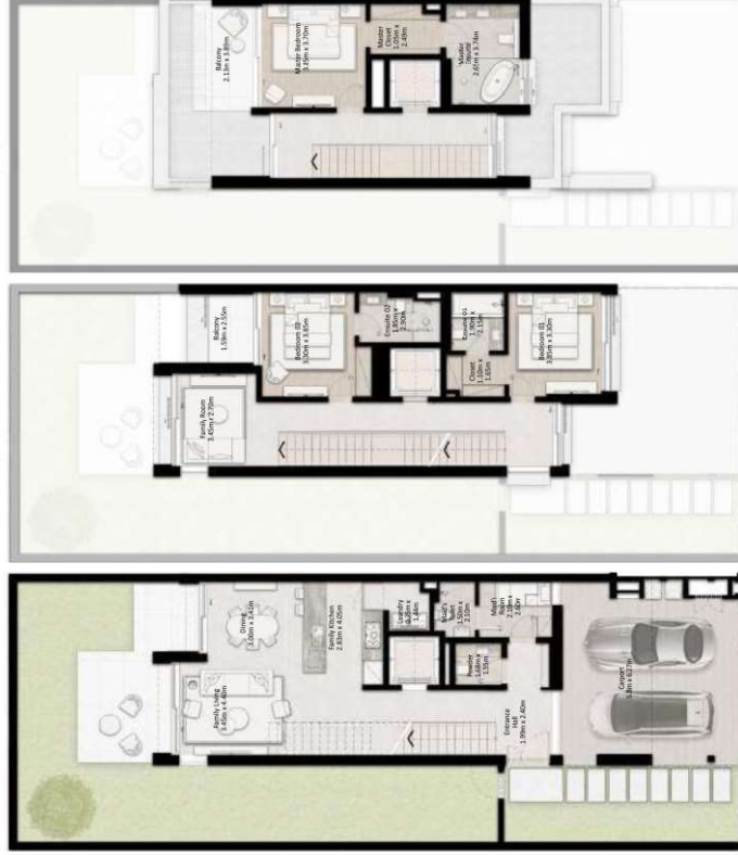
GROUND FLOOR FIRST FLOOR SECOND FLOOR

DISCLAIMER: PLANS, DETAILS, AND UNIT ORIENTATION INCLUDED ARE INDICATIVE ONLY AND ARE SUBJECT TO CHANGE BY THE DEVELOPER/SELLER AT ITS SOLE DISCRETION WITHOUT NOTICE AND/OR LIABILITY. ALL IMAGES, INCLUDING FEATURES, FINISHES, FURNISHINGS, VIEW, AND SCALE ARE ILLUSTRATIVE ONLY. FINAL AREAS, ORIENTATION, DIMENSIONS, LAYOUT, AND MATERIALS MAY DIFFER FROM THOSE STATED.